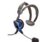
SR-20 Straight Cord