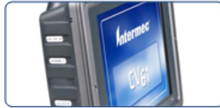
Withstands forklift life

Better yet, the CV61 offers the accuracy, productivity and safety of hands-free voice directed work. Support for Vocollect VoiceCatalyst is built-in. Read our "Voice Enabled Forklift" whitepaper at the link below, and take your forklift fleet to new heights.