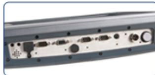
Docking system and UPS