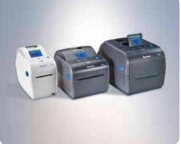
Printers and Media Solutions