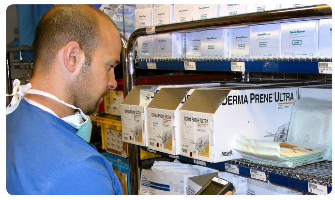
Supply Inventory & Asset Tracking Account for your inventory in real-time, whether it's medical supplies, new treatments, or high-value assets.

Easily and accurately create and scan product labels for specimen processing to reduce errors.