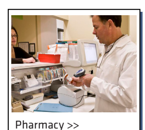
Partner customizable area: Solution, offer, and links to site